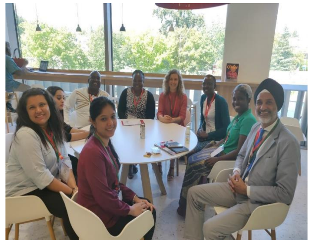
FIGURE 3 VISIT AND DISCUSSION AT THE GLOBAL FUND