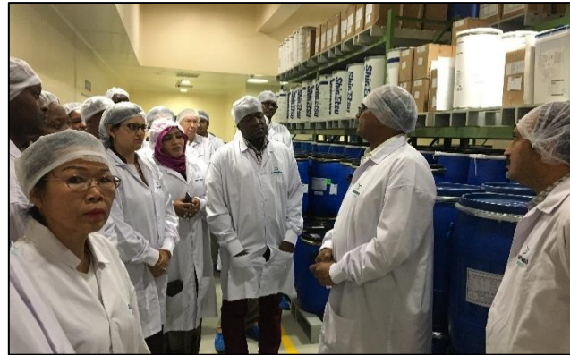
Site visit at USP & Aurobindo Pharma (left to right)