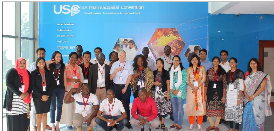
Group photo of the participants at USP